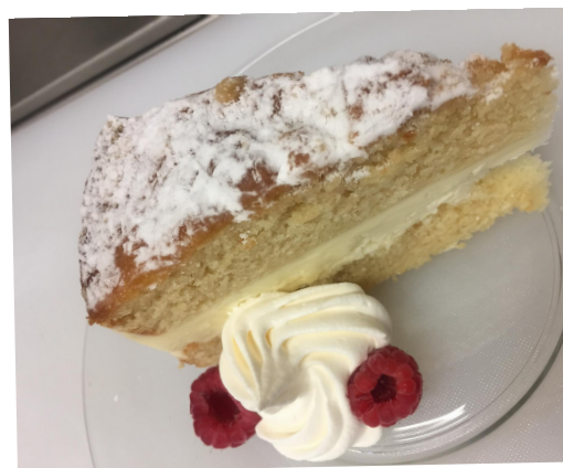
LEMON ITALIAN CAKE