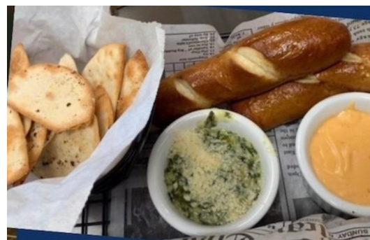
Half and Half