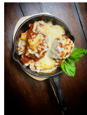
Skillet Cornbread & Meatballs