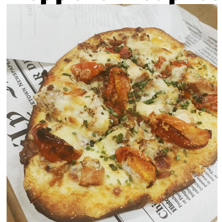
Wine Down Hot Brown